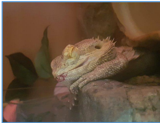
One of our bearded dragons is enjoying his foster home

The Animal Management team has also started using Microsoft Teams to run online lessons and this has been going well. Our animals are also doing well at their foster homes and our bearded dragons have been enjoying some raspberries.