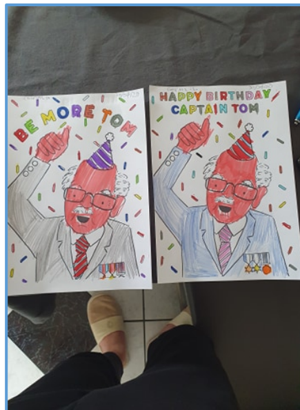
A Captain Tom drawing by a Prep 4 Life student, sent to our Facebook page